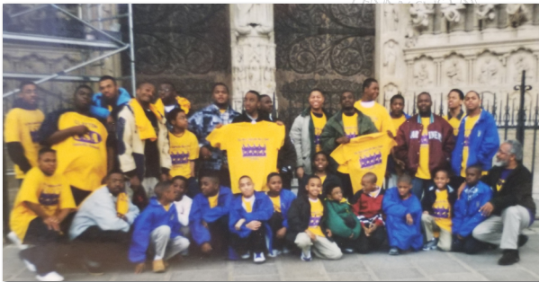
West Louisville Boys Choir During Their European Tour

Louisville, KY. The Academy has served and prospered thousands of young people from across Metro Louisville and enriched arts education in urban communities across Jefferson County. 2020 has